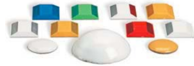
Figure 2. Temporary Buttons

Traffic paint is the material most commonly used for temporary pavement markings in work zones, as shown in Table 1. The advantages of traffic paint are that it's versatile, relatively inexpensive, and quickly installed. Traffic paint is formulated to dry within minutes after application, and can be applied either by hand using paint brushes or truck mounted marking system. Temporary tape is also a commonly used pavement marking in work zones due to its ease of installation and removal. Temporary buttons and raised pavement markers can be used to simulate solid lines or supplement existing flat-line pavement marking. Buttons are normally used where snow removal is not expected. Epoxy or thermoplastics materials create highly durable markings and may not be considered as "temporary" as the other markings discussed in this document are. However, high-traffic volumes or lengthy project duration may make it necessary to apply these markings to ensure that the markings are visible and adequate for traffic guidance and control. Because the characteristics of these materials vary, agencies may use several different types of temporary marking materials on a project based on project duration, traffic characteristics, and weather conditions.