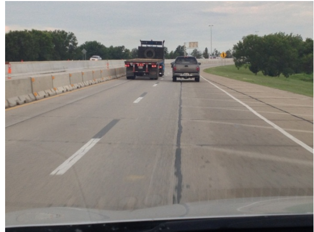
Figure 14. Contrast Striping, Oklahoma

Choosing the appropriate method of removal can minimize visible scarring of the pavement, but adding contrast striping can help to increase pavement markings conspicuity. Contrast striping involves adding another material (often black paint) to a stripe. It can be used to offset ghosting impacts by differentiating the markings. Figure 14 shows a location where contrast striping is used to provide users guidance in a complex situation. First, pavement marking removal “ghosts” are very visible on the right side of the roadway. In addition, the crack sealant on this route is more prominent than the pavement marking, which can be confusing for