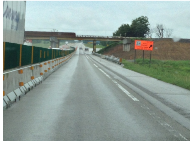
Figure 9. Use of Tabs on Barrier and Paint Wear on Edge Line on I-44 in Oklahoma

Ongoing inspection and maintenance of temporary markings should be conducted on long-term work zones. Inspection can be either visual or conducted using a retroreflectometer. Temporary markings should perform similarly to permanent markings for night and day operations. Figure 9 highlights why both a night and day inspection should be made. Although the loss of material is evident, the retroreflectivity of the line may have diminished sooner than the loss of marking material. The significance of the loss of marking is important; but there are other indications being used at this location to show the travel way to the driver. If excessive wearing of the marking is a concern, practitioners may use other supplemental devices to guide drivers through the work zone, such as reflective tabs on a barrier, reflective strips on a glare screen, a rumble strip in the shoulder, and delineation on the guardrail itself, as Figure 9 illustrates. These traffic control devices all supplement and support the driver traveling through this work zone and ensure adequate guidance until restriping can be completed. As part of the inspection, all of these devices should be reviewed to be sure the drivers' path is delineated through the work zone.