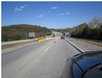
Figure 15. Example of Disallowed Black Paint Covering Temporary Pavement Markings

road users and cause them to use this as their lane line. The contrast stripe – a black stripe added at the end of the typical white stripe – provides additional information to drivers about the correct lane line so they can see the appropriate path to travel.