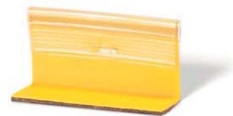
Figure 1. Temporary Plastic Tab