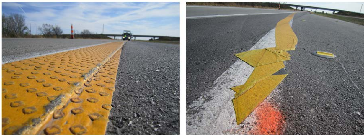
Figure 6. Pavement Marking Damage in a Work Zone

The Indiana Department of Transportation reapplies temporary road markings on long-term work zones on Interstate routes prior to winter to ensure markings are adequate throughout the year.