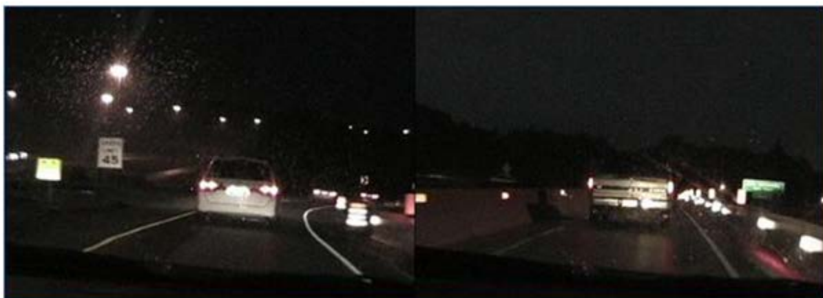
Figure 8. All-weather Pavement Marking (left) and Standard Pavement Marking (right) Work Zones on US-32/33/50 Eastbound in Ohio (Nighttime).