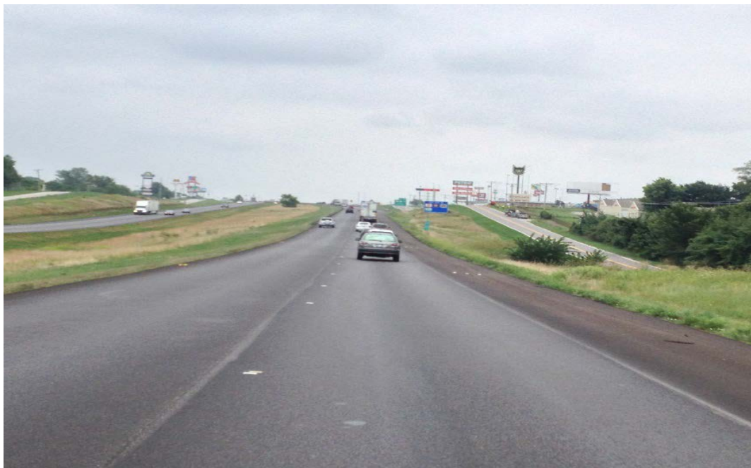
Figure 3. Use of Temporary Raised Pavement Markers on Centerline and Shoulder on I-70 in Missouri.