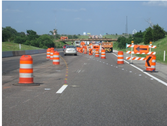
Figure 4. Use of Temporary Raised Pavement Markers on Lane Shift on I-44 in Oklahoma.