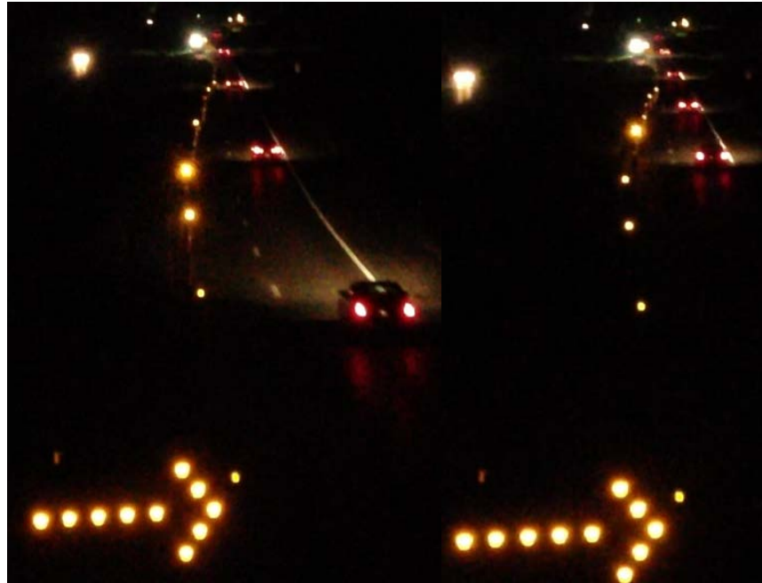
Figure 16. Sequential Work Zone Taper Warning on US Route 54 in Missouri.