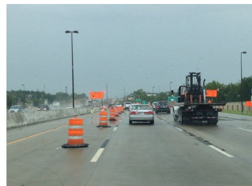
Figure 10. Oklahoma Work Zone in Wet Weather Conditions

Measuring Retroreflectivity. A number of agencies have recognized the need to measure the performance of pavement marking. Although there are not minimum retroreflectivity levels for work zones, some agencies are using retroreflectivity to ensure installed pavement marking is adequate for the driving public. Table 4 lists a few states that have incorporated minimum retro-reflectivity values into their operations. Combining retroreflectivity with physical condition information (e.g. pavement type and condition, horizontal alignment, weather) can ensure an adequate marking throughout the work zone for most physical conditions and for the wide range of drivers.