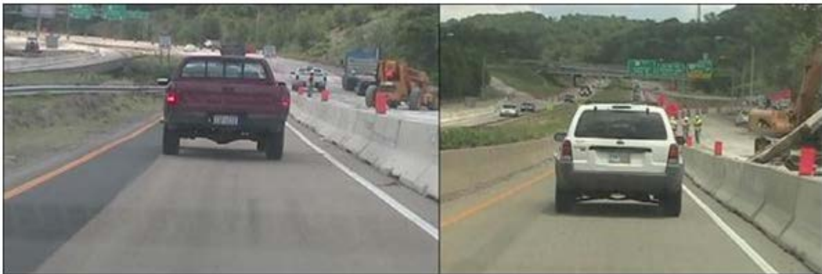
Figure 7. All-weather Pavement Marking (left) and Standard Pavement Marking (right) Work Zones on US-32/33/50 Eastbound in Ohio (Daytime).

While the MUTCD does not have specific performance measures for temporary pavement markings, many transportation agencies use industry established guidelines or specifications for permanent markings to govern temporary pavement marking applications. Practitioners should also inspect these lines to be sure the markings are in good condition. Any condition causing a loss of reflectivity such as debris or loss of pavement marking material should be evaluated for possible repairs. For example, Figure 7 shows a well maintained line during the day. Figure 8 is showing the same work zone, but water is covering the line and reduces the retroreflectivity in the photo on the right. The line on the left in figure 8 is an all-weather paint which still shines through the water.