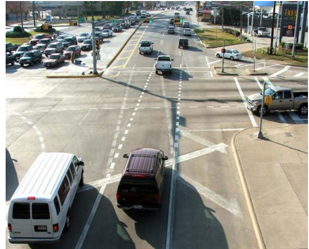
Figure 13. Removed Markings ("Ghost Markings") Compared to Existing Pavement Markings

The results of the study are shown in Tables 6 and 7. One of the highest rated methods was a chemical process. The chemical process is environmentally friendly and completely removes marking with no pavement scarring.