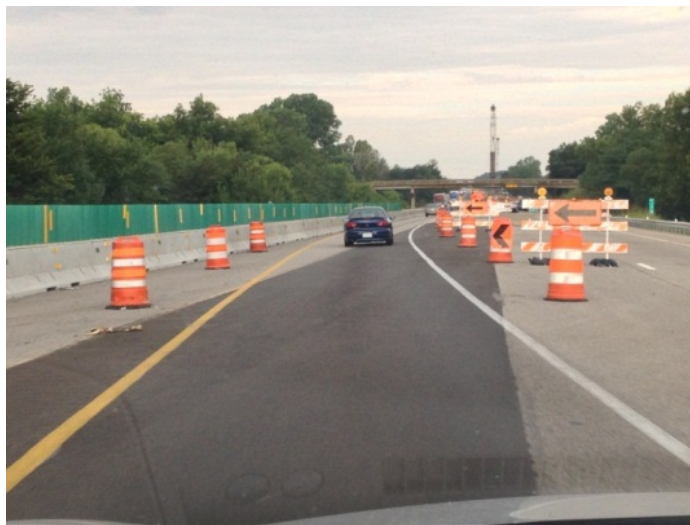
Figure 5. Use of Paint on Lane Shift on I-44 in Oklahoma.