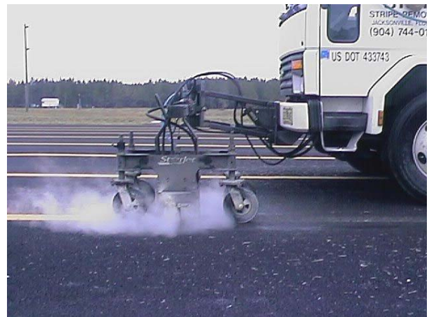
Figure 12. Example of Water-Blasting to Remove Striping in Florida

The results of the study from the second phase of the AWP study found the AWP retroreflectivity values were confirmed to be higher than standard pavement markings. Motorists typically maintained safer lane placements when traveling along the AWP delineated lanes than in lanes with standard pavement marking within the same work zones.